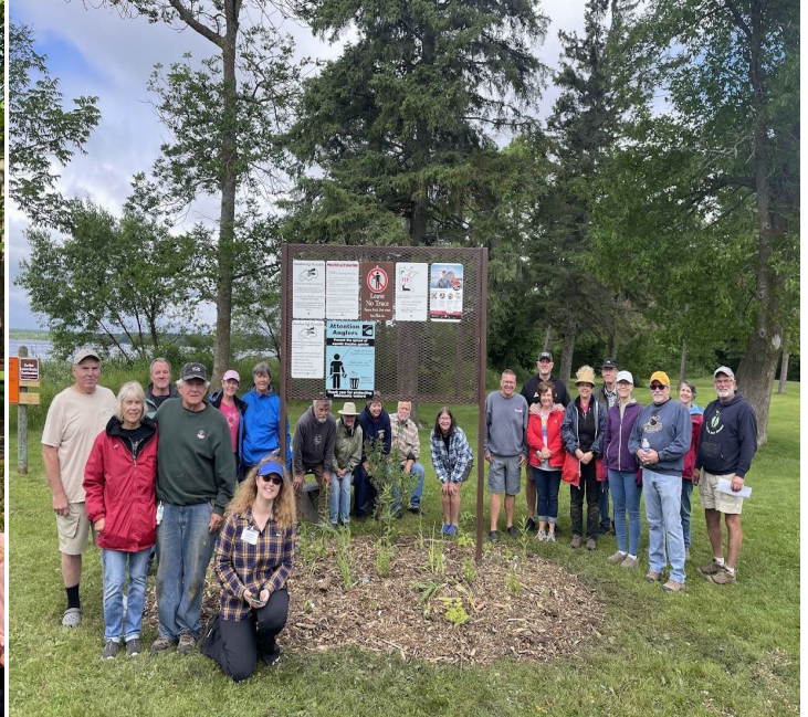
30 volunteers from the Steamboat Lake Association planted native species to thrive in the marshy conditions left by a wet spring.