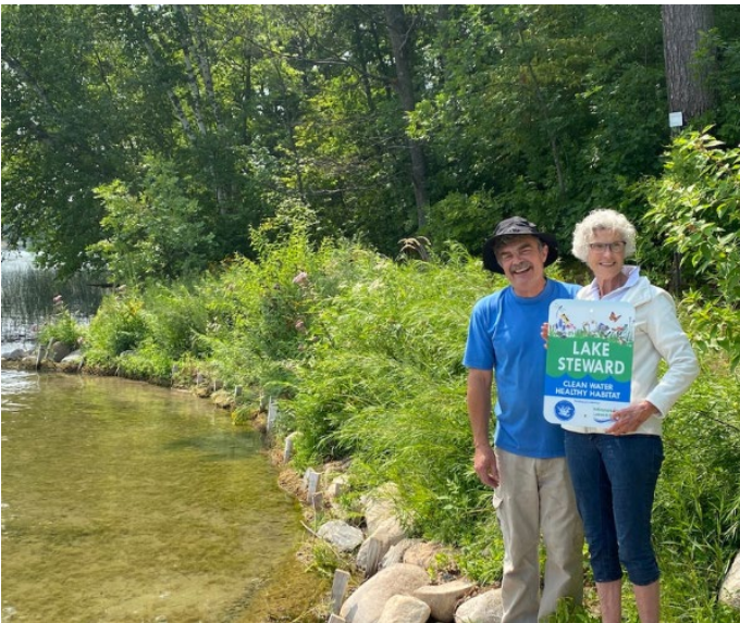
325 property owners were awarded a Lake Steward sign in 2024

Lake Stewards across the state are helping address a growing challenge facing Minnesota's lakes: the concerning loss of 40–50% of its natural shorelines. Development permits have steadily increased since 2014 and in lake-dense areas like Crow Wing County, population growth has intensified the pressure on these fragile ecosystems. Properties with a "lawn to the lake" generate 10X more runoff and release 9X more phosphorus than vegetated shorelines, leading to algae blooms, declining water quality, and the loss of fish and wildlife habitat.