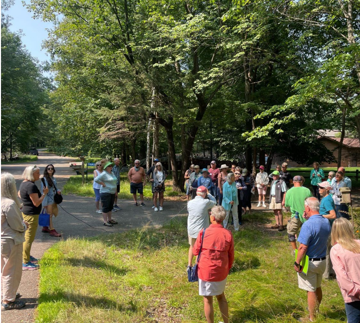
Gull Chain of Lakes Association's Native and Natural Bus Tour highlights the beauty and benefits of natural shorelines, Summer 2024

Neighboring collaboration in the program helps lake associations build more connected communities. In the north, Steamboat Lake Association's Lake Stewards planted a pollinator garden at the public access, and Lake Washburn Association hosts an annual Lake Steward Luncheon with a plant giveaway. In north-central Minnesota, Big Pine Lake Property Owners Association has seen membership grow with the expansion of the program. The Gull Chain of Lakes Association also hosted a Native and Natural Bus Tour last summer to celebrate Lake Stewards, showcase natural shoreline projects, and connect homeowners with restoration experts.